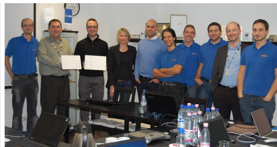
Photo: Successful Delivery Review Board meeting of CHEOPS Radiators STM model (Structural and Thermal Model) on 27 November 2014 in Miskolc with the participation of the Swiss consortium leaders.